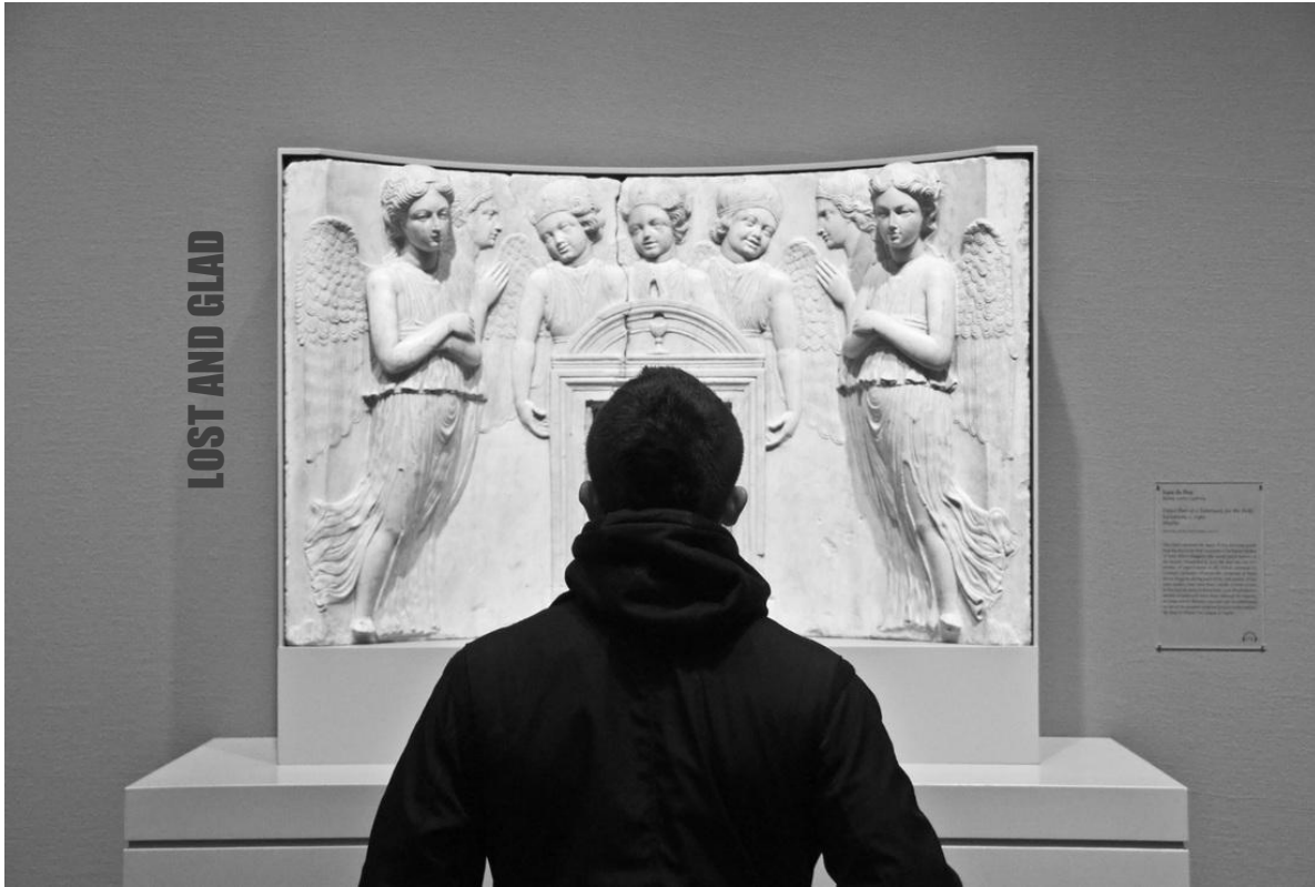
Sample Back Cover